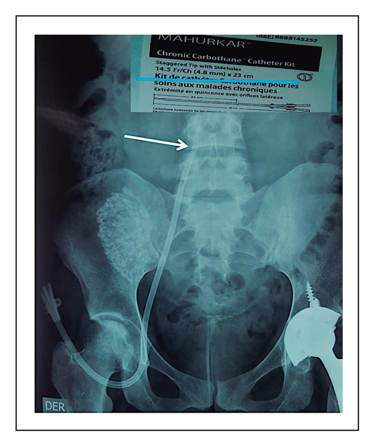
Figure 2. 23 cm (from cuff to tip) length femoral catheter, the tip location is in L4.